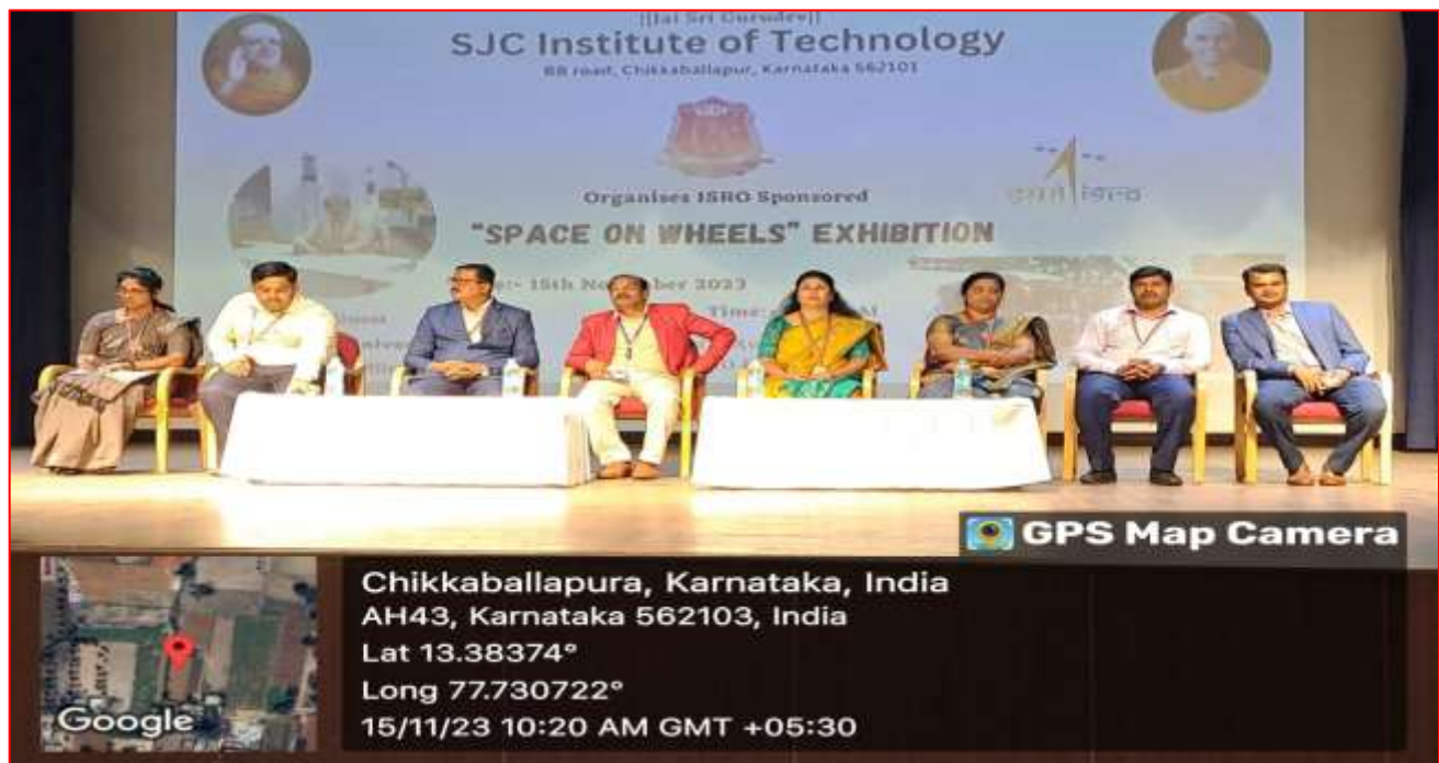
ISRO SPONSERED "SPACE ON WHEELS" EXHIBITION